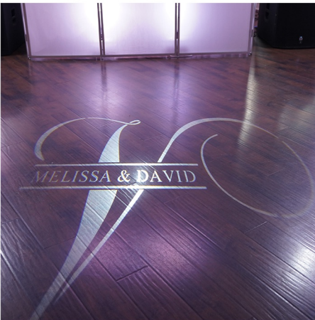
Name in Lights $300

A custom designed logo, cut into a metal gobo, then projected on the dance floor or a focal point of your venue.