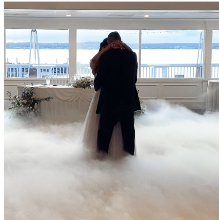
Dancing in Clouds $375

Cold Sparklers emit a fountain of sparks which are not subjected to catching fire.