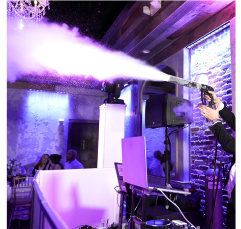
CO2 Canon $375

An odorless dry ice effect that makes you feel like you're dancing in the clouds.