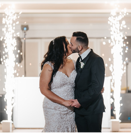
Cold Sparklers 2 for $500 / 4 for $875

Cold Sparklers emit a fountain of sparks which are not subjected to catching fire.